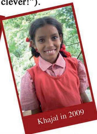
Khajal in 2009