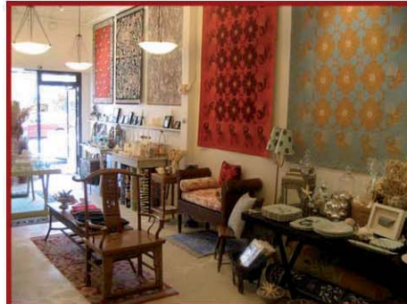
Jo Ellen Designs at 22 Main Street, Camden, ME 04843

Visit Jo Ellen Designs at 22 Main Street and tell them you are an Agape supporter!